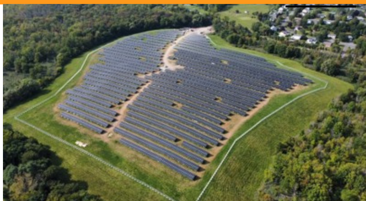
Example of a Community Solar Project